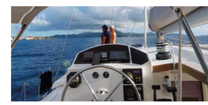
Sail Catamaran Rental

It is efficient and comfortable with a single semi-flybridge helm station which gives total visibility and complete maneuverability.