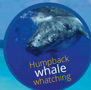
Humpback whale whatching

Whale, dolphin, and pilot whale watching in the wild. Visit the atoll Tetiaroa (Marlon Brando), the bird island with its nature reserve.